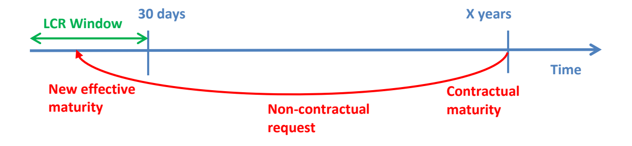
Chart 1: Effect of a counterparty non-contractual request on maturity