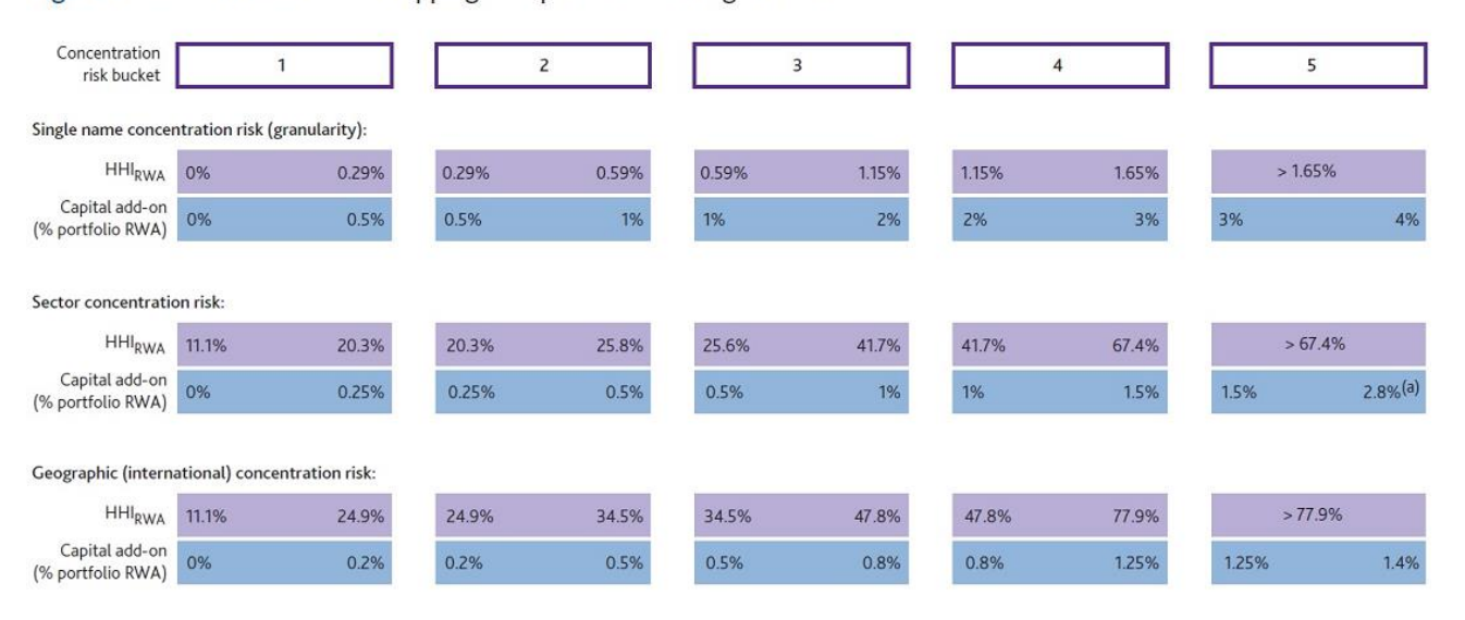
Figure 1 Concentration risk — mapping of capital add-on ranges to HHI