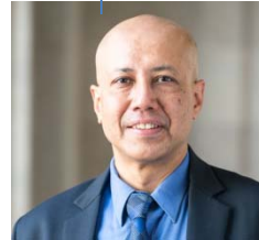
Somnath Chatterjee Financial stability