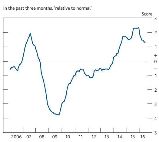
Chart 6 Retail goods and consumer services prices