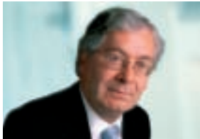
Mervyn King Governor