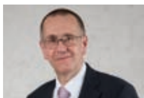
Adrian Piper Wales