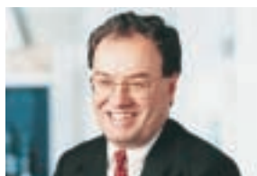
Andrew Bailey Executive Director Banking Services and Chief Cashier