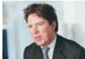
Paul Tucker Deputy Governor