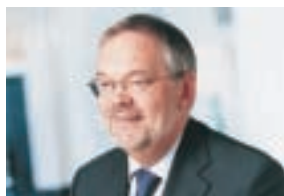
Charlie Bean Deputy Governor Monetary Policy