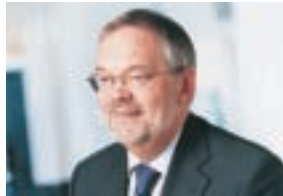
Charlie Bean Deputy Governor