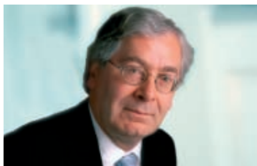
Mervyn King Governor

The past year has been the most challenging for the Bank of England since it gained independence in 1997. My predecessor, Eddie George, guided the Bank through that transition twelve years ago. It was with deep sadness that the Bank announced his death on 18 April. His memorial service will provide an opportunity for all of us to celebrate Eddie's achievements.