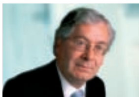
Mervyn King Governor