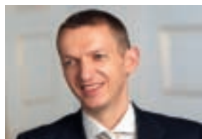
Andy Haldane Executive Director Financial Stability