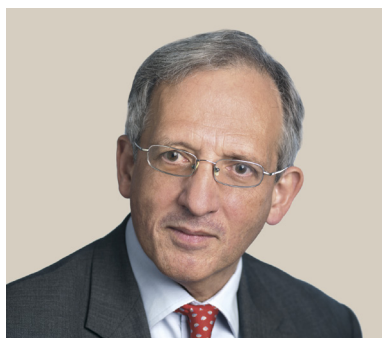
Jon Cunliffe Deputy Governor, Financial Stability

The United Kingdom's financial market infrastructures (FMIs) are critically important, providing functions that are relied upon by the public and financial system every single day. Over the past year, the Bank's supervision of these FMIs has contributed significantly to its financial stability objective. As the financial, economic, and risk landscape within which FMIs operate continues to evolve, so will the Bank's supervision of FMIs.