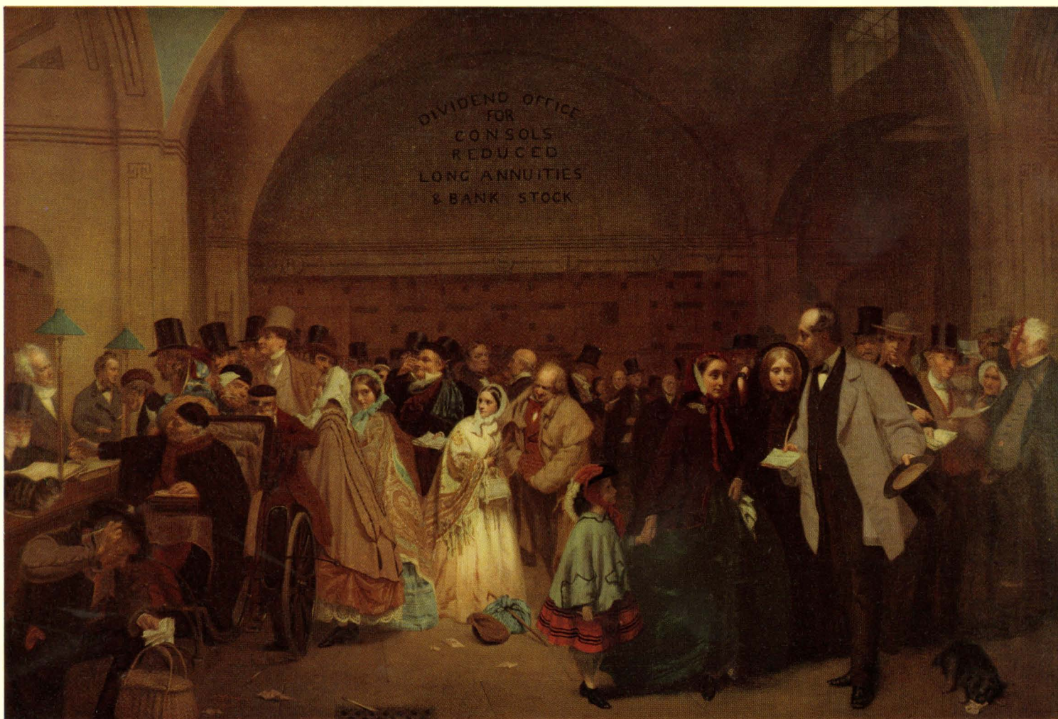
"DIVIDEND DAY AT THE BANK OF ENGLAND", 1850