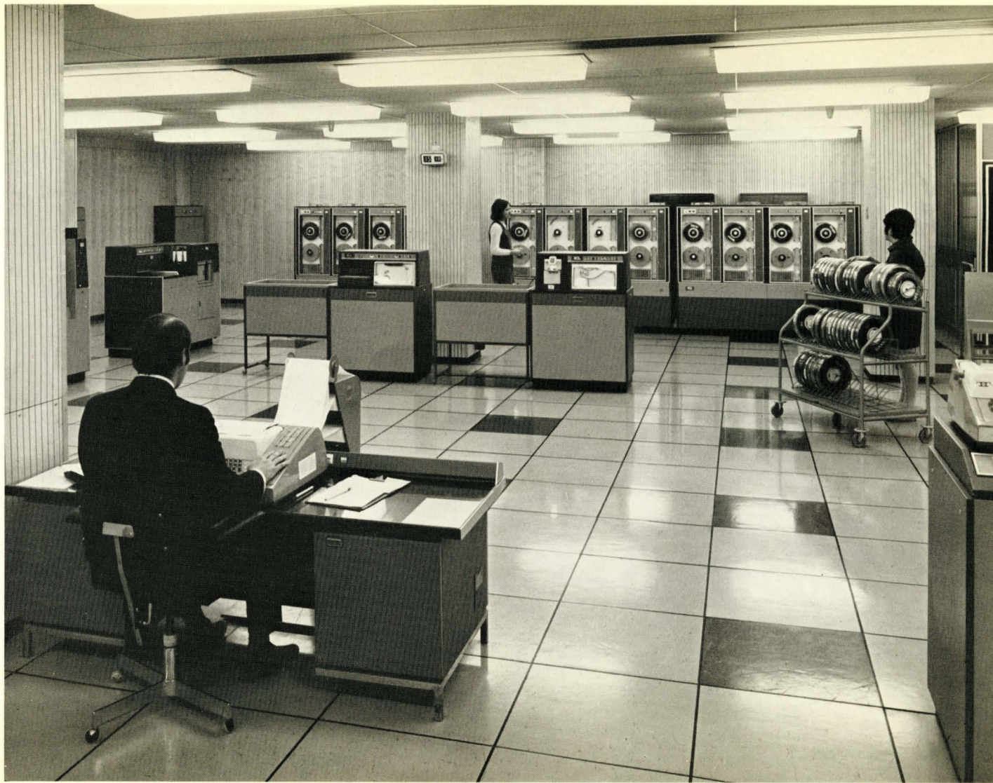
The Head Office Computer Centre