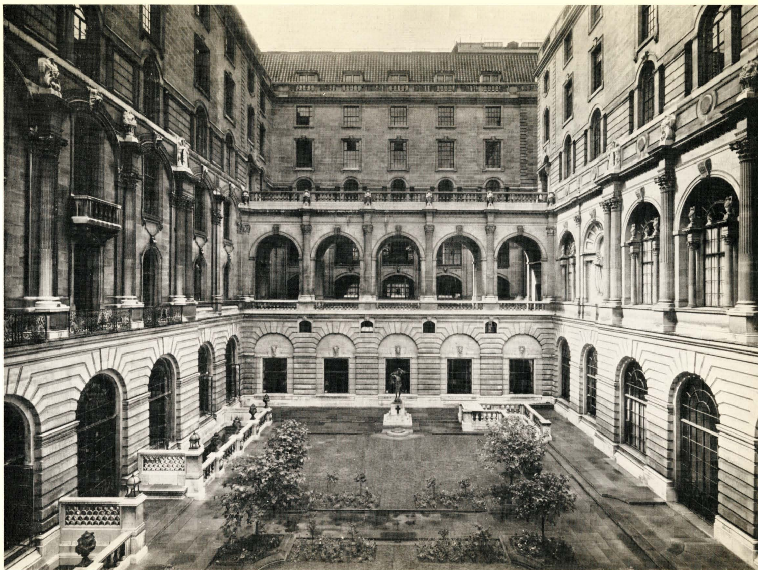
The Garden Court