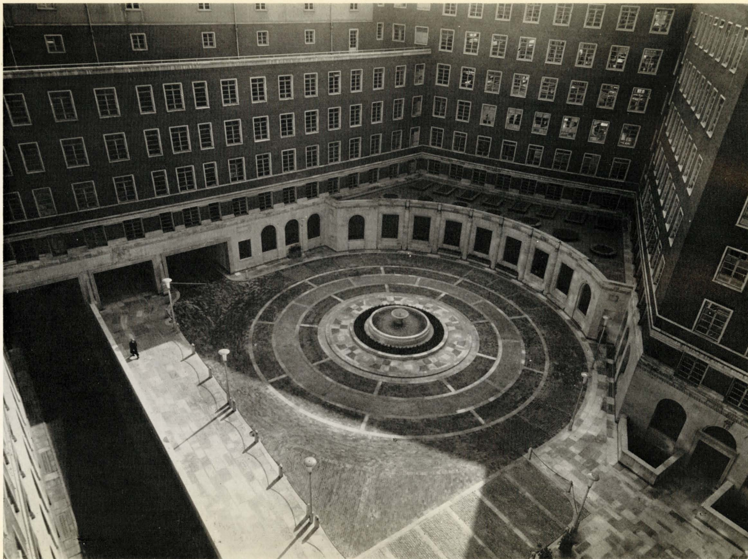
The South Court at New Change