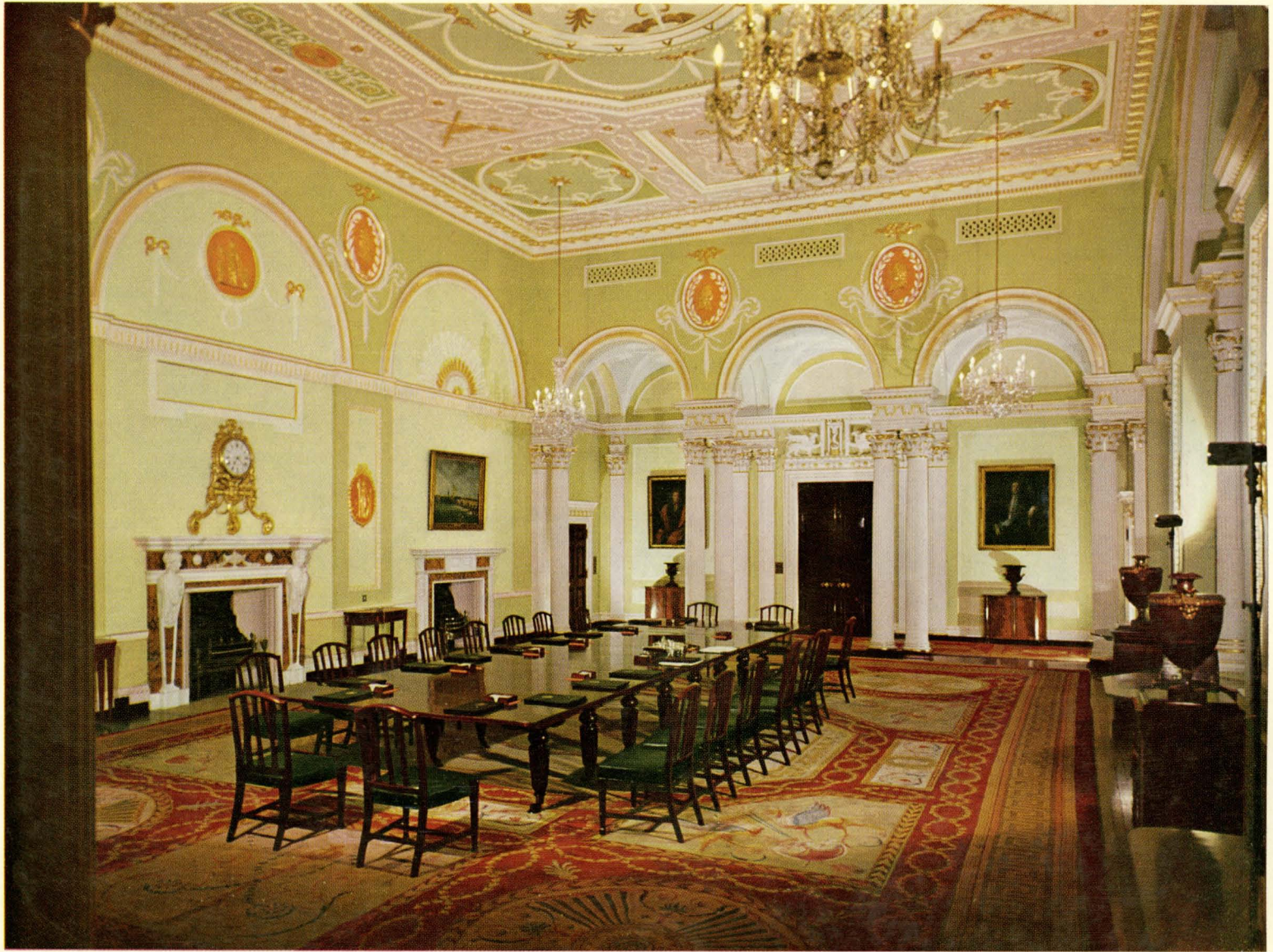
The Court Room