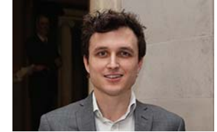
Angus Foulis Economic Modelling and Econometrics