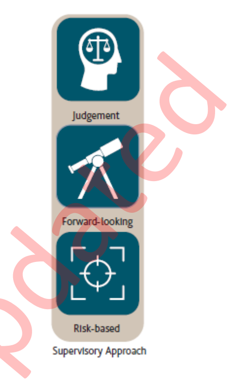
Figure 1: Key principles of our supervisory approach

To advance our objectives, our supervisory approach follows three key principles – it is: i) judgement-based; ii) forward-looking; and iii) focused on key risks. Across all of these principles, we are committed to applying the principle of proportionality in our supervision of firms.