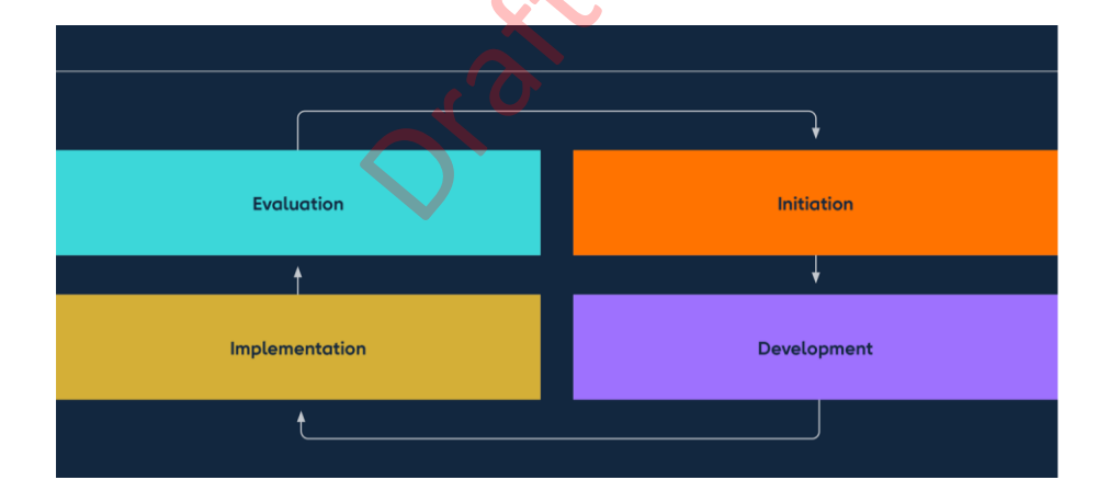
Diagram 1: Overview of the Policy Cycle