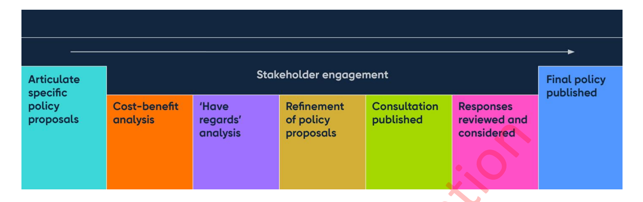
Diagram 3 - Stages within the Development Phase<sup>25</sup>

5.30 We consult on our policy proposals via a Consultation Paper (CP), and consider all responses before finalising our policy. Diagram 3 illustrates the stages within the Development Phase.