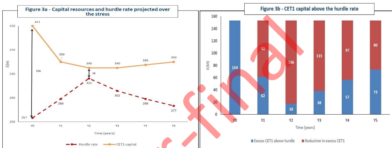
Figure 3 Calculation of the PRA buffer – illustrative example

9.33 Assume the CCoB is £94m (2.5% of £3778m – the starting RWAs), and CCyB is set at £19m (0.5% of £3778 RWAs). The amount of CET1 capital depletion not covered by the CCoB and the CCyB is the PRA buffer, i.e. £136m minus £94m minus £19m = £23m (0.6% of £3778m RWAs). As the firm has excess capital resources to meet the CCoB, CCyB and the PRA buffer, based on this example, the firm will not need to raise capital to meet the PRA buffer.