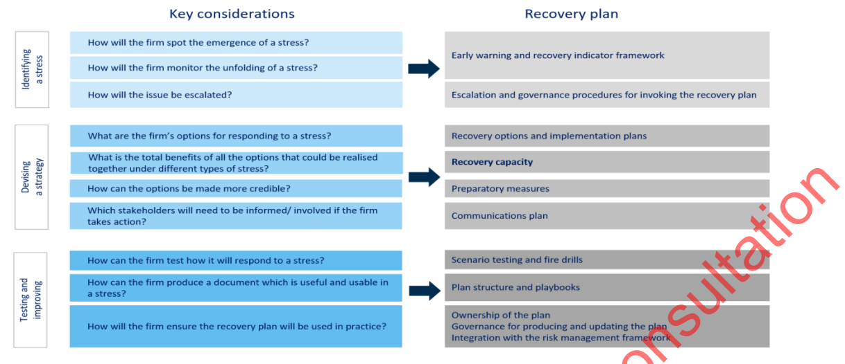
Figure 2: Components of recovery planning

Non-systemic UK banks: The Prudential Regulation Authority's approach to new and growing banks July 2020 21 22 July 2020: Draft Superisory Statement for consultation closing Wednesday 14 October 2020. Please see: https://www.bankofengland.co.uk/prudential-regulation/publication/2020/new-and-growing-banks