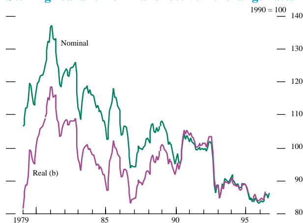
Chart 1 Sterling real and nominal effective (a) exchange rates

(a) Trade-weighted indices. (b) Based on relative consumer prices.