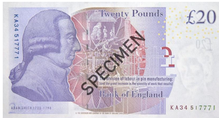
Figure 1: a £20 banknote

Significant because it honours Adam Smith, the great moral philosopher and hero of the Scottish Enlightenment.