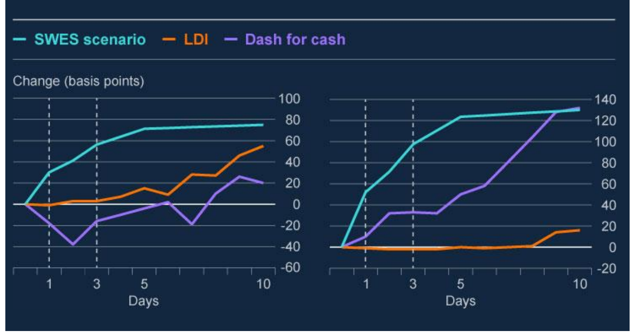
Chart C: Evolution of 10-year US Treasury yields (left) and sterling investment-grade corporate bond spreads (right) over the 10-day horizon encompassed in the price paths, compared to the dash for cash and LDI episodes<sup>(a)</sup>

Sources: Bloomberg Finance L.P, Board of Governors of the Federal Reserve System (US) and Bank calculations.